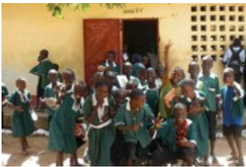
Children at Sololo after receiving letters from their link school

Sololo basic cycle school linked with Ingatestone and Fryerning junior school last October. They have been exchanging letters since this time. The junior school has also been fundraising and the money will be used towards re-roofing two classrooms. BEA is also sponsoring 13 children at this school in grades 7-9.