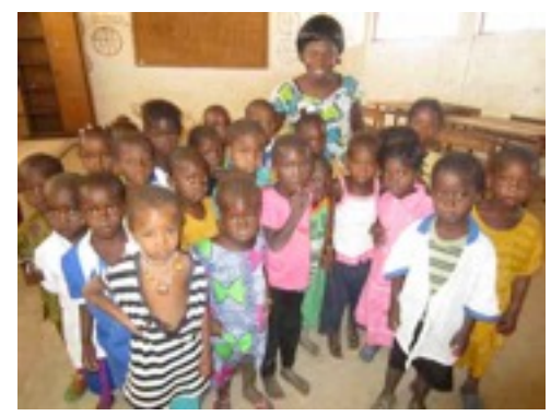
The nursery class with their teacher

I also visited a new school during my February visit, Sukuta lower basic school, as Feering primary school was looking for a link school. This school is also very remote being accessed by a four-wheel drive along sandy roads for 15 km. The village is composed of traditional buildings only and there is no shop locally that villages can access. The school were delighted to welcome me and they look forward to developing links and benefitting from BEA support.