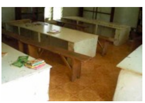
The flooring completed

The library as was Now the roof has been removed and the height of the building increased to allow more air circulation. The building work is coming on slowly as I like to see the progress before each new stage.