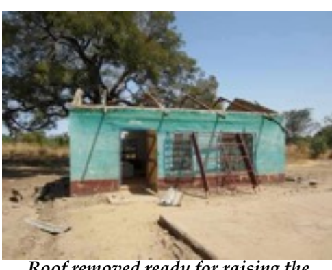
Roof removed ready for raising the sides

Sololo basic cycle school linked with Ingatestone and Fryerning junior school last October. They have been exchanging letters since this time. The junior school has also been fundraising and the money will be used towards re-roofing two classrooms. BEA is also sponsoring 13 children at this school in grades 7-9.