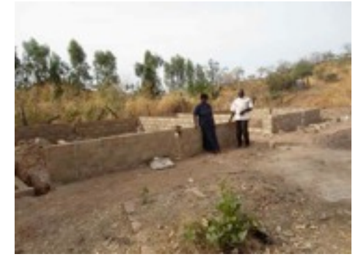
Progress up to my visit in February

Another organisation, Empower is also helping with this. From what I have heard the building of 3 classrooms, an office and store is now up to the roofing level.